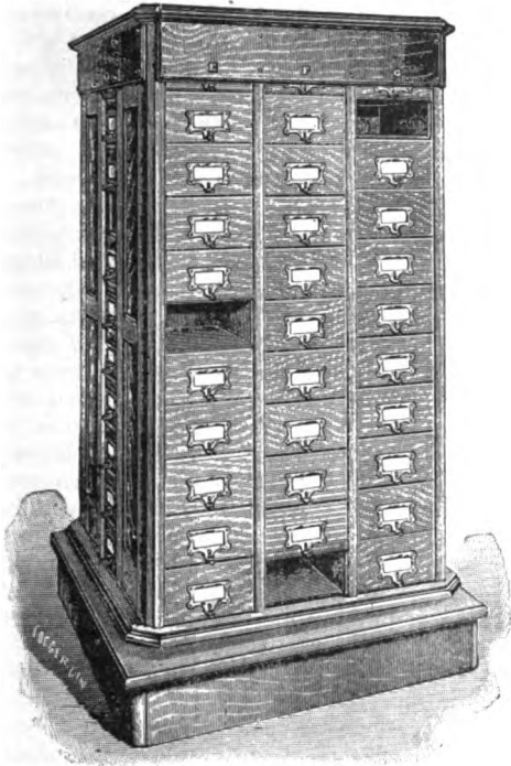
REVOLVING CATALOGUE CABINETS.

The American Bolt and Screw Case Co., Dayton, Ohio, have added to their line of Dust-Proof Revolving Cabinets an admirable one calculated to hold a number of catalogues, which is something wanted in every thorough-going Hardware store, and we present an illustration of the same herewith. These Cabinets are made of thoroughly seasoned chestnut, and finished in natural-wood antique oak, golden oak, or mission, as desired. They are made by first-class cabinet makers, are well finished, occupy a small floor space, and are claimed to be the most convenient Catalogue Cabinets ever placed on the market.